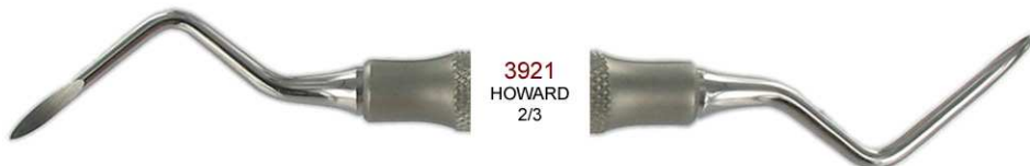
3921 HOWARD 2/3