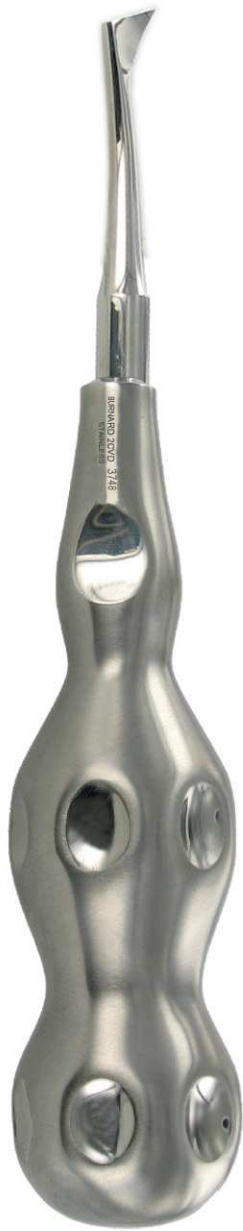
3816 CRYER 27L

For pulling, lifting up the periosteum and making the tooth loosen from the periodontal ligament for easy extraction.