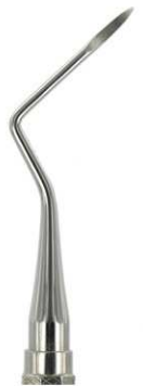
3909 APICAL 9L