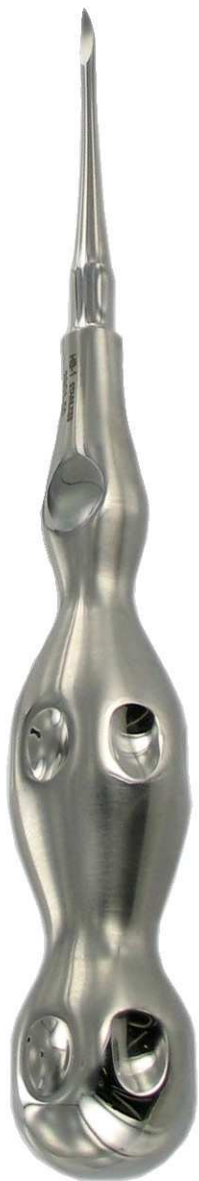
3901 HEIDBRINK HB-1

For pulling, lifting up the periosteum and making the tooth loosen from the periodontal ligament for easy extraction.