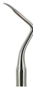
3905 HEIDBRINK HB-5