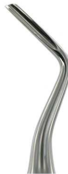
3865 R 2.5mm