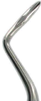
3822 HYLIN 2S