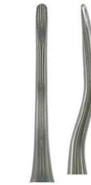
3830 LINDO LEVIN-E93 SERRATED