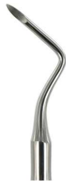
3903 HEIDBRINK HB-3