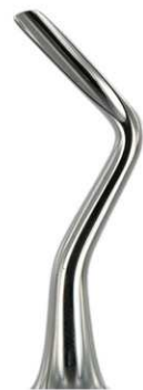
3867 R 3mm