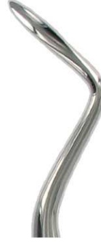
3824 HYLIN 3S