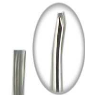
3761 COUPLAND 1 2.5mm