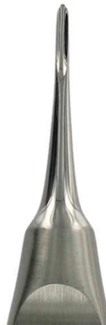
3878 HYLIN 12cm