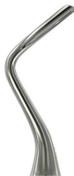
3864 L 2.5mm