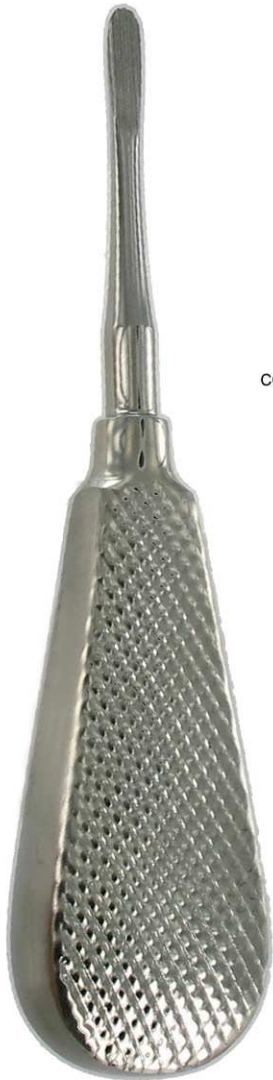
3826 COLE MAN 1STR

For pulling, lifting up the periosteum and making the tooth loosen from the periodontal ligament for easy extraction.