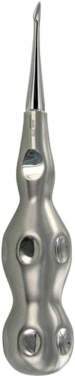
3748 BURNARD 2 CVD

For pulling, lifting up the periosteum and making the tooth loosen from the periodontal ligament for easy extraction.