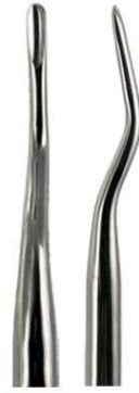
3768 E 46R