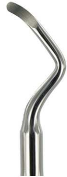
3735 MILLER APEXO 72