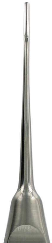
3878 HYLIN 16cm