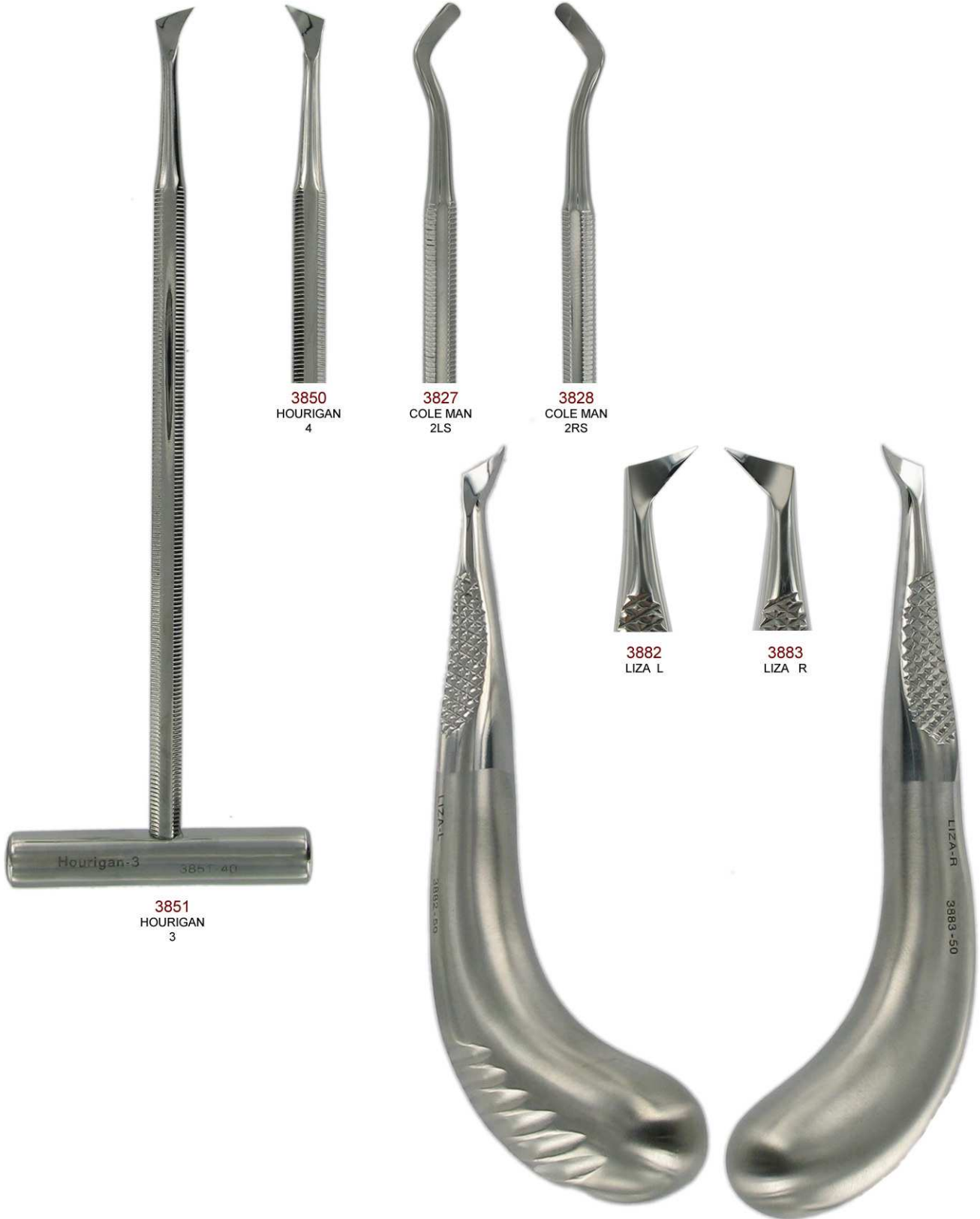
3850 HOURIGAN 4

For pulling, lifting up the periosteum and making the tooth loosen from the periodontal ligament for easy extraction.