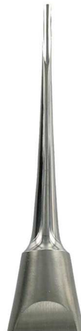
3878 HYLIN 14cm