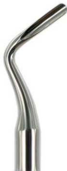
3739 APICAL 302 3L