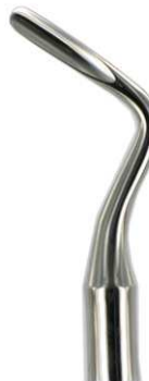
3741 APICAL 303 4R