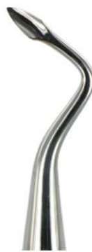
3750 BURNARD 4R