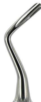
3866 L 3mm