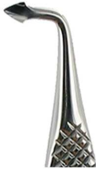
3750S BURNARD 4S