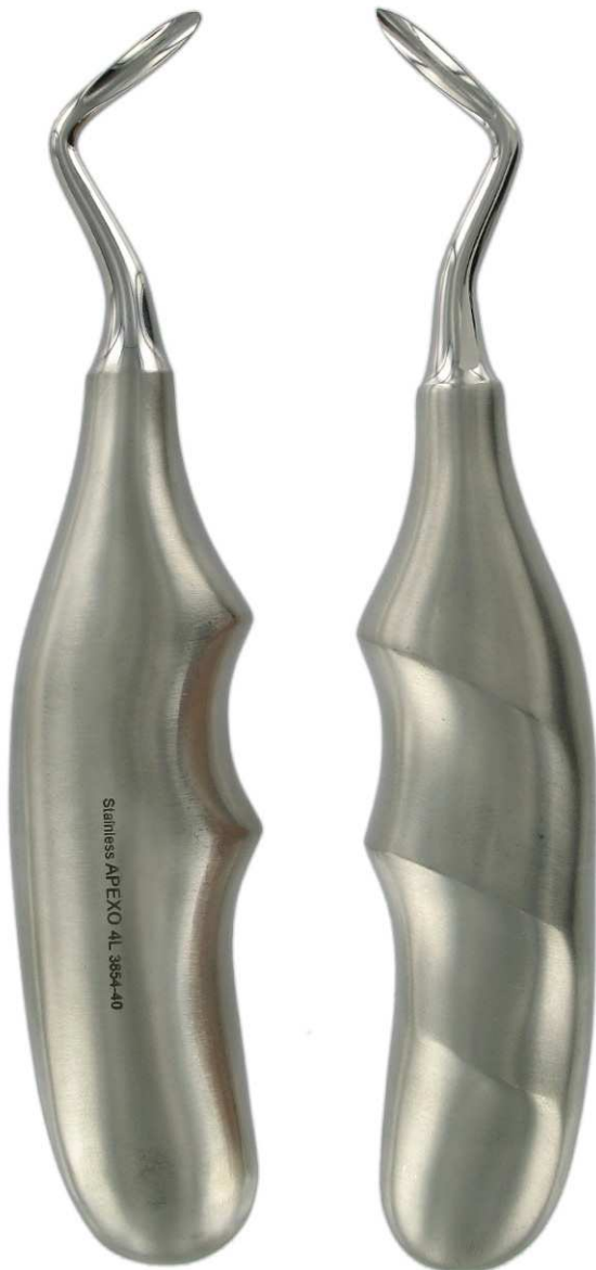
3854 FLOHR L

For pulling, lifting up the periosteum and making the tooth loosen from the periodontal ligament for easy extraction.