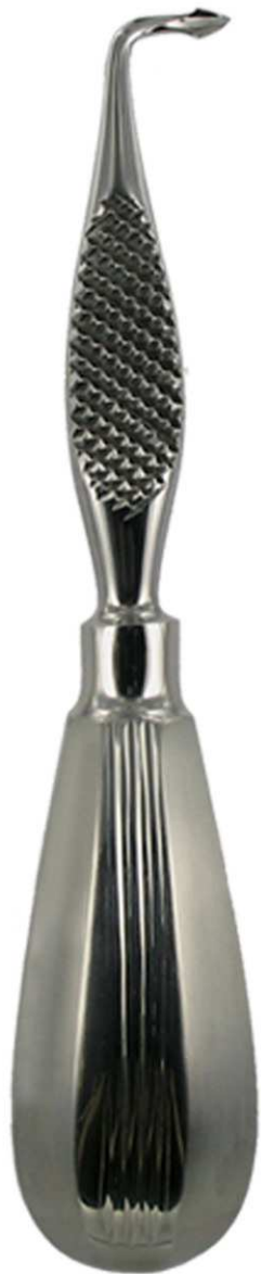
3747S BURNARD 3 S

For pulling, lifting up the periosteum and making the tooth loosen from the periodontal ligament for easy extraction.