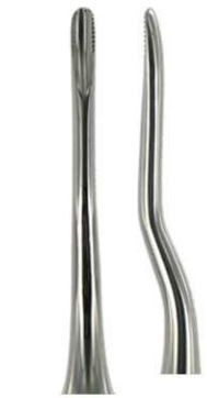
3831 LINDO LEVIN-E92 SERRATED