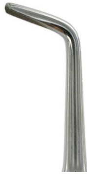
3889 JK-3 3.5mm