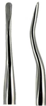
3767 E 46