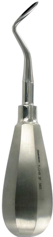
3803 FLOHR 3R