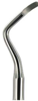
3734 MILLER APEXO 71