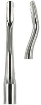
3820 IN BEIN-E77 4mm