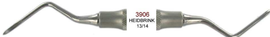
3906 HEIDBRINK 13/14