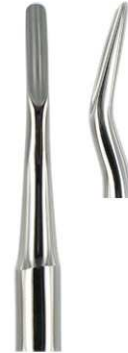
3818 OUT BEIN-E77R 3mm