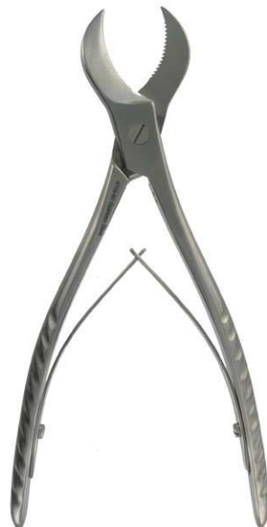
4708 PLASTER CUTTING PLIER 17cm