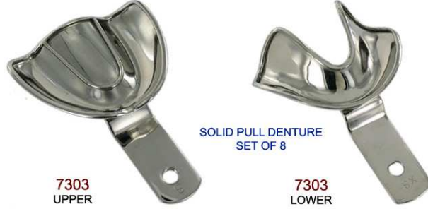
SOLID PULL DENTURE SET OF 8