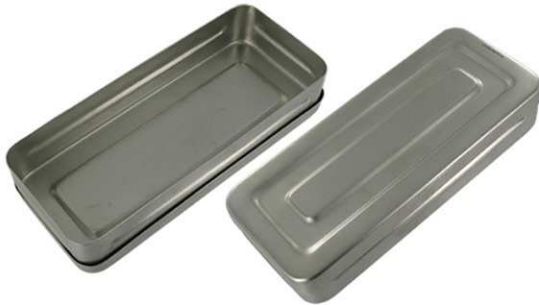
7408 6" X 10"