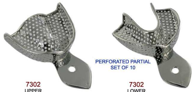
PERFORATED PARTIAL SET OF 10