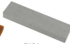
7424 SHARPENING STONE ARKANSAS FLAT