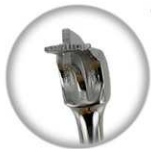
4605 CROWN SPREADER