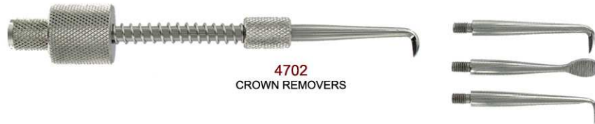
4702 CROWN REMOVERS