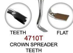
4710T CROWN SPREADER TEETH