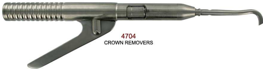
4704 CROWN REMOVERS