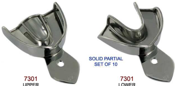
SOLID PARTIAL SET OF 10