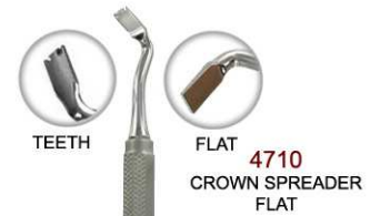
4710 CROWN SPREADER FLAT