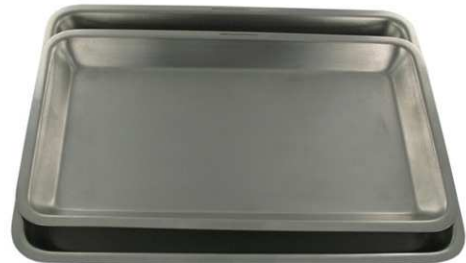
7410 215 X 127 X 13mm 215 x 165 x 16mm