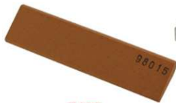
7423 SHARPENING STONE INDIA SLIP