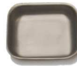
7425 TRAY IMPLANT