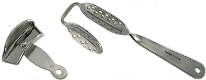
7311 ADJUSTABLE SOLID