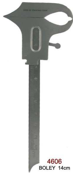
4606 BOLEY 14cm