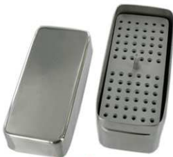
7412 ENDODONTIC BOX