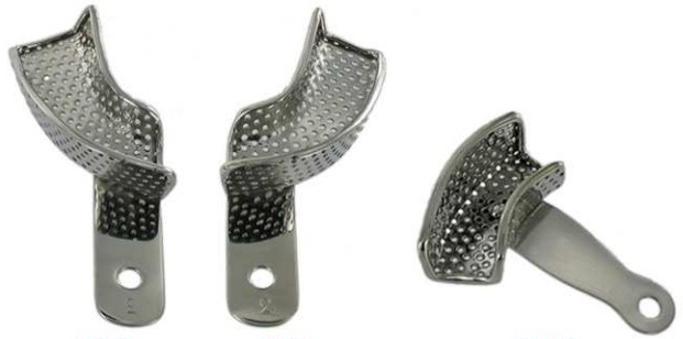
7309 UPPER RIGHT LOWER LEFT