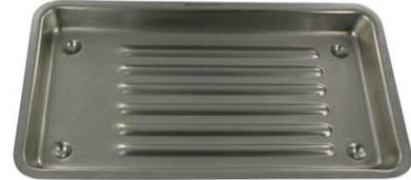
7407 SCALERS TRAY