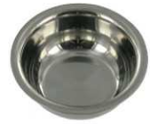
7426 TRAY IMPLANT