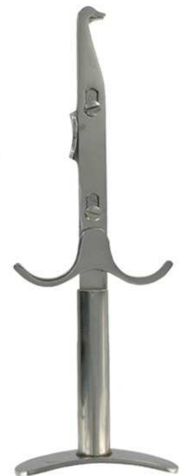
4705 CROWN SPREADER