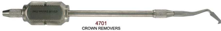
4701 CROWN REMOVERS