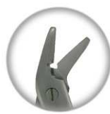
4603 UNIVERSAL 12cm