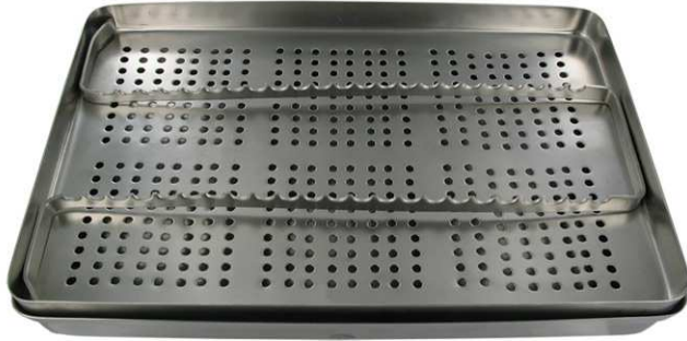
7401 SOLID BASE WITHOUT SEPARATOR