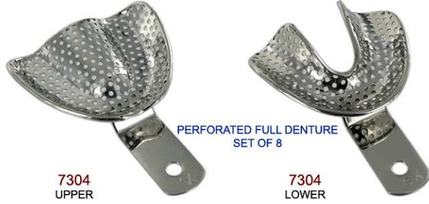
PERFORATED FULL DENTURE SET OF 8