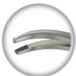
4610 CROWN GRIPPER