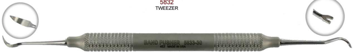
5833 SCALER/LIGATURE DIRECTOR