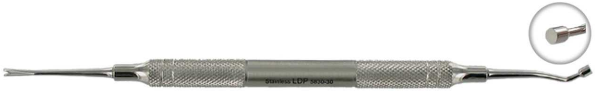
5830 LDP LIGATURE DIRECTOR/PLUGGER

Commonly used instruments in orthodontic procedures.