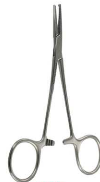
5821 MOSQUITO FORCEPS 12.5cm