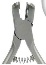
5602H Distal End Cutter & Hold T/C