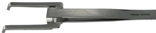
6216 PAPER HOLDING FORCEP DOUBLE JAW