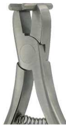
5733 BENDING PLIER 0.75mm 12.5cm