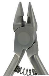
5718 BIRD BEAK 12.5cm