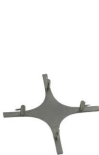
5817 BRACKET POSITIONING GAGE