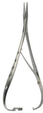
5810 MATHIEU PLIERS 14cm