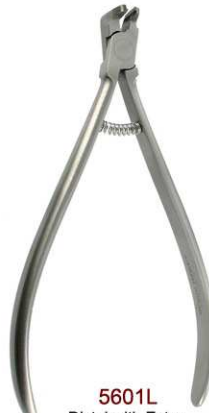
5601L Distal with Extra long Handle T/C