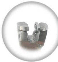
5602H Distal End Cutter & Hold