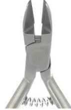
5604 Wire Cutter STR T/C