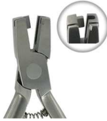
5703 NANCE 13.5cm