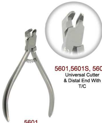
5601 Distal End Cutter T/C

For cutting wire during orthodontic procedures.