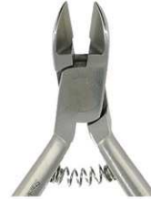
5607 Soft Wire STR