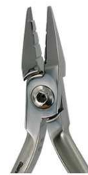
5716 SLIM NOSE JARABEK 14cm