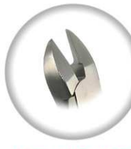
5603, 5608, 5609S Cutter 15°