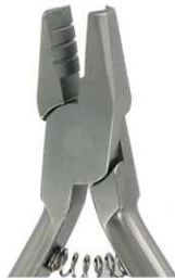
5732 GROVES BENDING 12.5cm