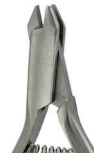
5723N THREE JAW ADERER SMALL 11.5cm