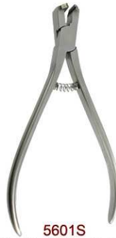
5601S Distal End Cutter Slim T/C