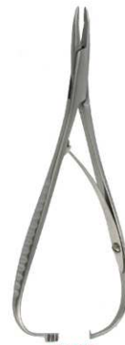
5812 MATHIEU LIGATURE PLACING PLIERS 14cm