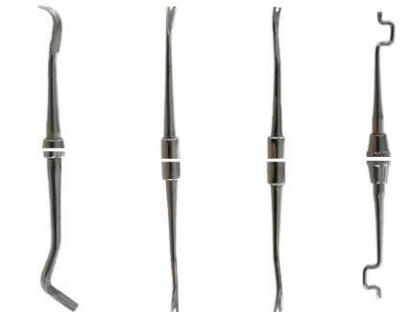
5801 BAND SEATION & REMOVING