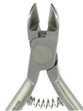
5608 Soft Wire 15°