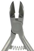
5603 Wire Cutter 15° T/C