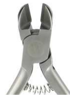
5624 Hard Wire Cutter STR