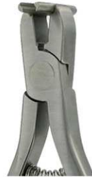
5734 BENDING PLIER 1mm 12.5cm