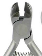
5625 HARD WIRE CUTTER CVD 15°