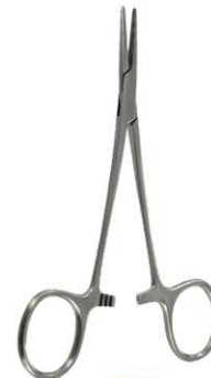
5814 MOSQUITO PLIERS 12.5cm