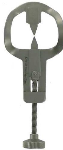
6214 IVORY SEPARATOR