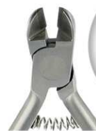
5625 Hard Wire Cutter 15°