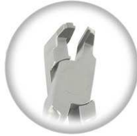
5601, 5601S, 5601L Universal Cutter & Distal End With T/C