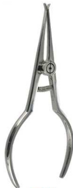
5818 LIGATURE TYING PLIERS