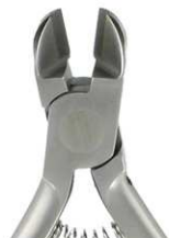
5624 HARD WIRE CUTTER STRAIGHT