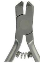
5602 Distal End Flush T/C