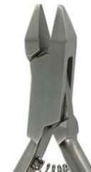
5729 ADAMS 12.5cm