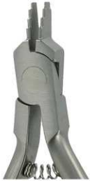
5731 NANCE 12.5cm

For bending wire during orthodontic procedures.