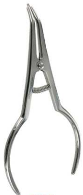
5809 SEPARATING PLIERS 15.5cm