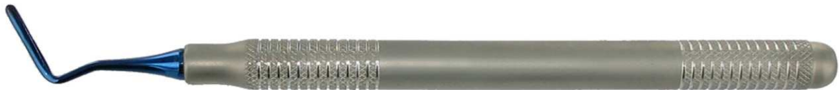
1925T PT-3 TITANIUM Angel S/E