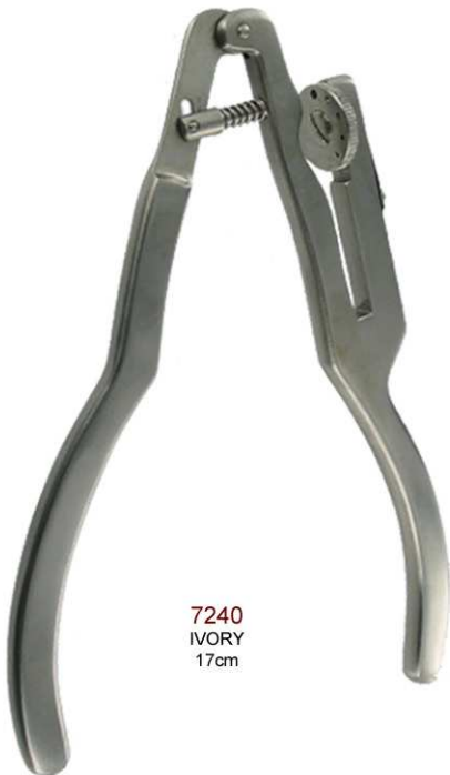
7240 IVORY 17cm