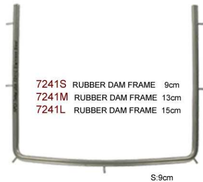
7241S RUBBER DAM FRAME 9cm 7241M RUBBER DAM FRAME 13cm 7241L RUBBER DAM FRAME 15cm