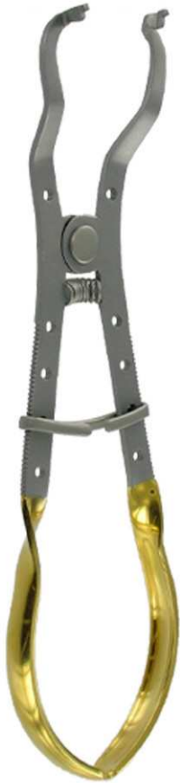
7236 IVORY LIGHT WEIGHT 17cm