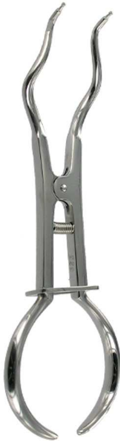
7237 BREWER 17.5cm