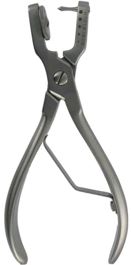
7239 AINSWORTH 17cm