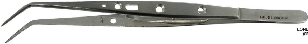
6517L LONDON-COLLEGE (SELF-LOCKING) 15cm