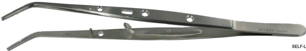
6515 SELF-LOCKING 15cm