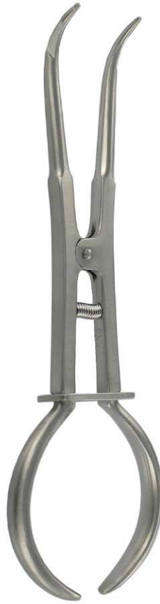
7238 STOKE 17.5cm