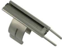
4627 ENDO FINGEL ROLLER