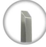
4504 LUCAS 16cm