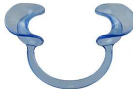
6438 SPANDEX SMALL 10cm