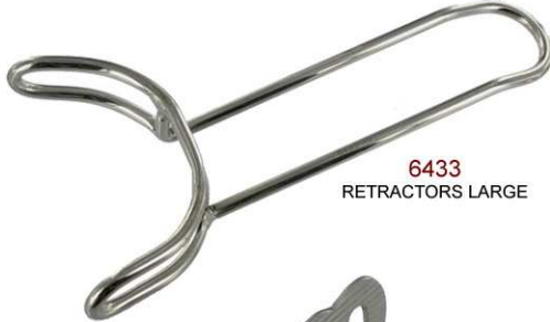
6433 RETRACTORS LARGE