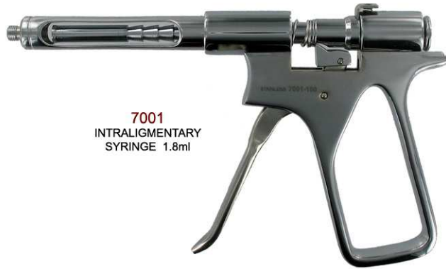
7001 INTRALIGAMENTARY SYRINGE 1.8ml

3-WAY SYRINGES – Supplies air, water, or a mist through separate interval channels created by combining pressurized air with water flow.