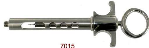
7015 SYRINGE 1.8ml