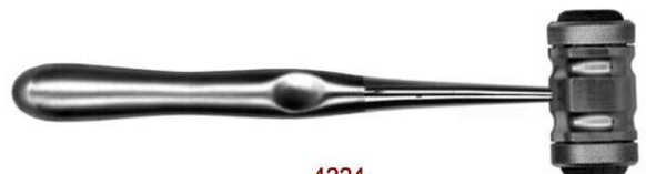
4224 MEAD-2 MALLET