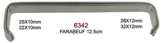
6342 FARABEU 12.5cm