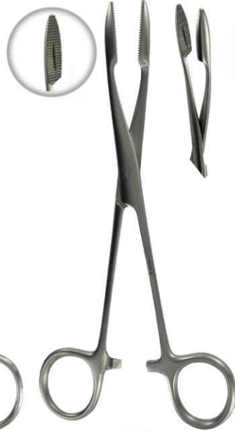
5206 WITHOUT RATCHET 18cm