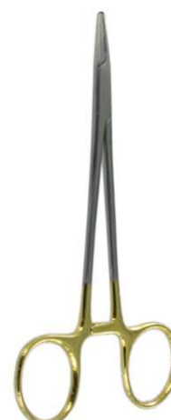
5519 WEBSTER 11.5cm