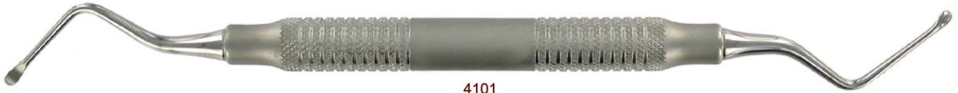
4101 84 LUCAS