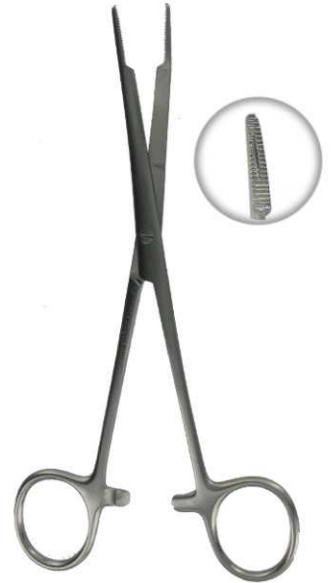
5204 CURVED 21cm