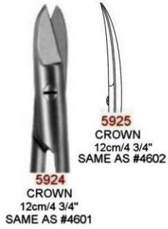
5925 CROWN 12cm/4 3/4" SAME AS #4602