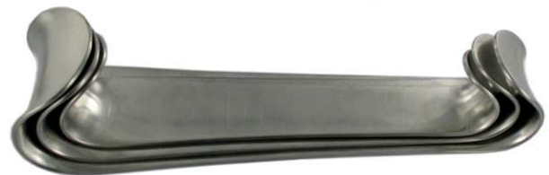
29mm 26mm 22mm