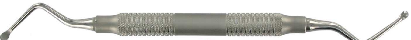
4107 87 LUCAS