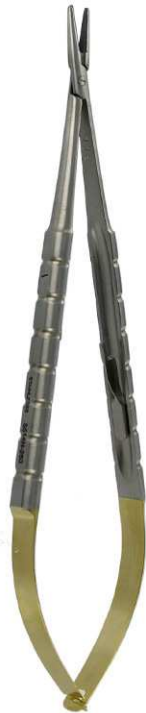
5514 CASTROVIEJO T/C 18cm 7"