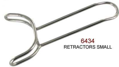
6434 RETRACTORS SMALL