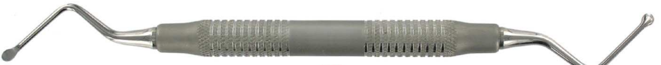
4103 86 LUCAS