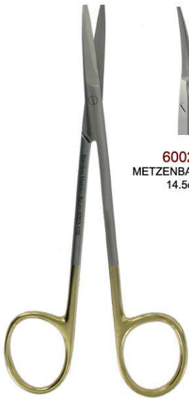
6001 METZENBAUM 14.5cm