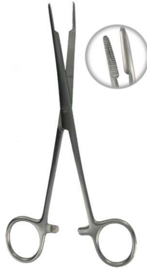
5203 CURVED 17.5cm