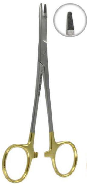
5504 OLSON-HEGAR 15cm

High-tech welding of tungsten carbide greatly improves the durability and serration. Exceptionally upgrades the performance.