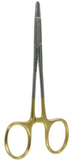
5507 RYDER 15cm 5508 RYDER 18cm