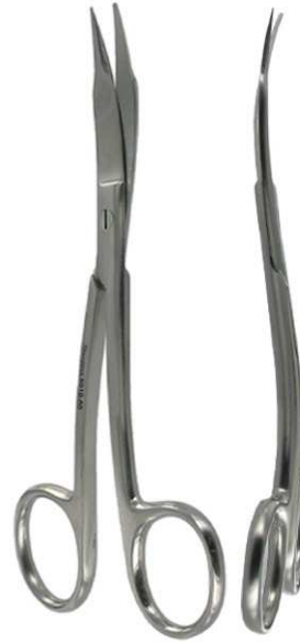
5916C GOLDMAN-FOX CVD 12.5cm