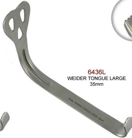
6436L WEIDER TONGUE LARGE 35mm