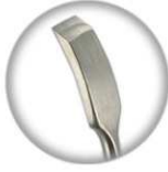
4503 FREER 16cm