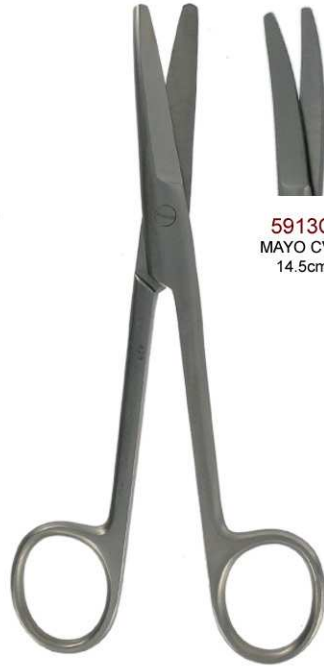
5913C MAYO CVD 14.5cm