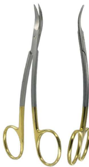
5917TC LA GRANGE CVD 11.5cm