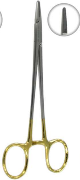
5505 CRILE-WOOD 15cm 5505L CRILE-WOOD 18cm