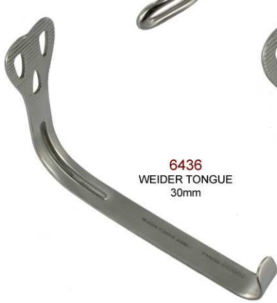
6436 WEIDER TONGUE 30mm