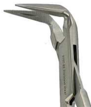
5107 Available 90° Degree