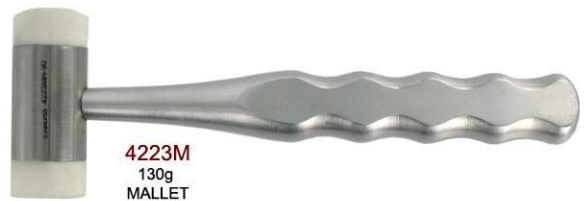
4223M 130g MALLET