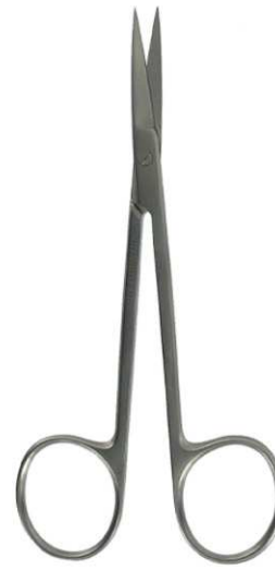
5919 IRIS 11.5cm