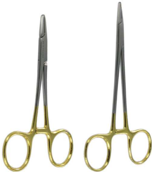
5509 DERF 11.5cm