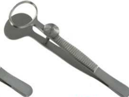
6444 12 X 21 mm