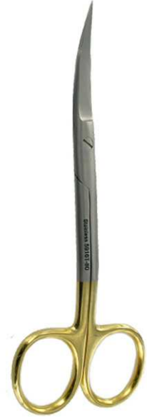
5916TC GOLDMAN-FOX CVD 12.5cm