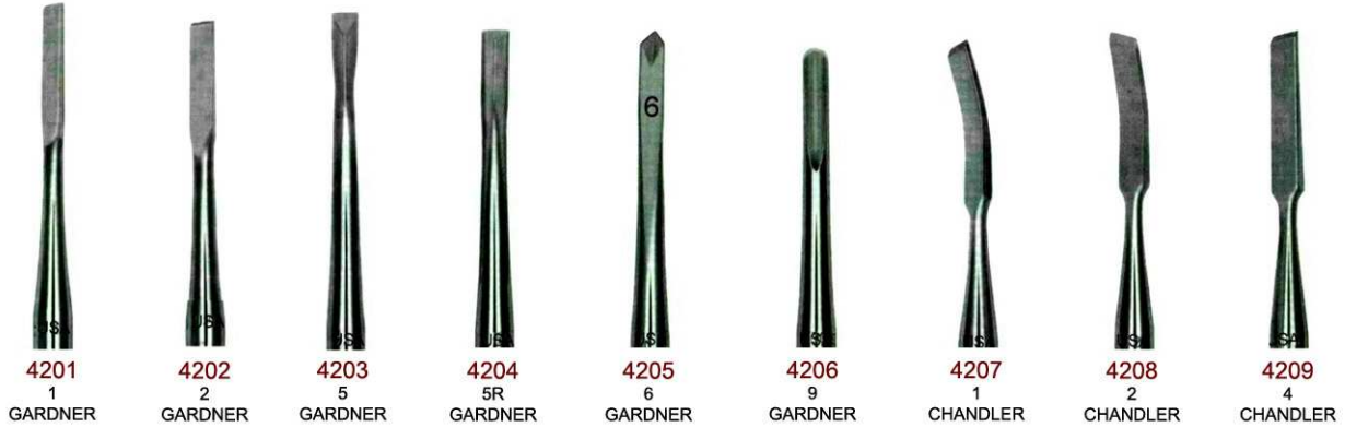
4201 1 GARDNER 4202 2 GARDNER 4203 5 GARDNER 4204 5R GARDNER 4205 6 GARDNER 4206 9 GARDNER 4207 1 CHANDLER 4208 2 CHANDLER 4209 4 CHANDLER