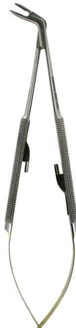
5531 CASTROVIEJO STRAIGHT T/C CVD 45°