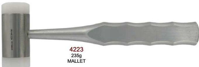
4223 235g MALLET