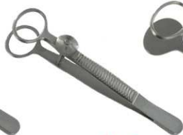
6443 11 X 16 mm