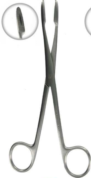
5205 WITHOUT RATCHET 18cm