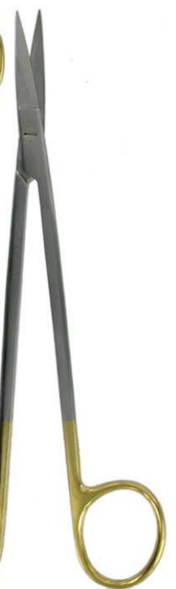
6014 KELLEY 16cm