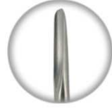
4505 LUCAS 16cm