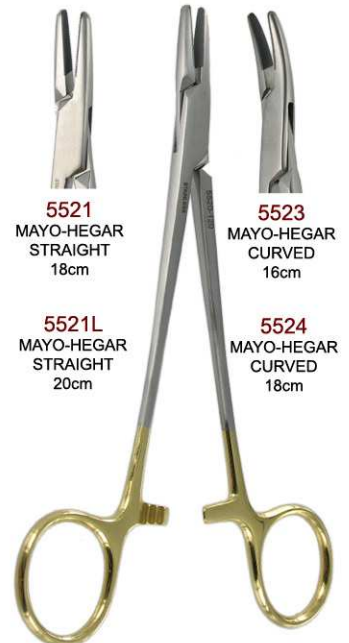
5521 MAYO-HEGAR STRAIGHT 18cm