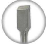
4502 FREER 16cm