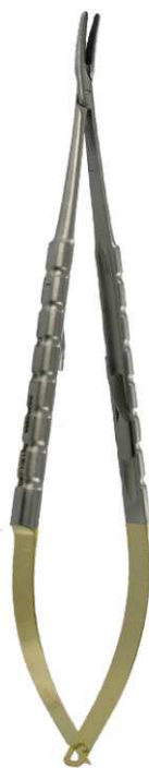
5516 CASTROVIEJO T/C CURVED 18cm 7"