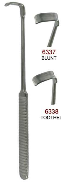
6336 STANDELL-STILLE 18cm