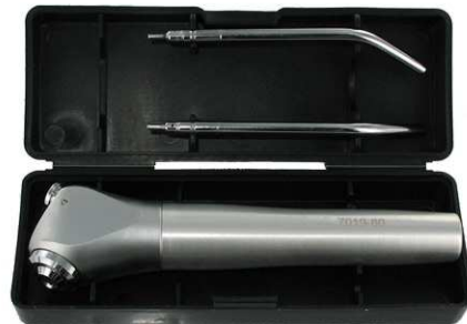
7019 WATER SYRINGE 3WAY