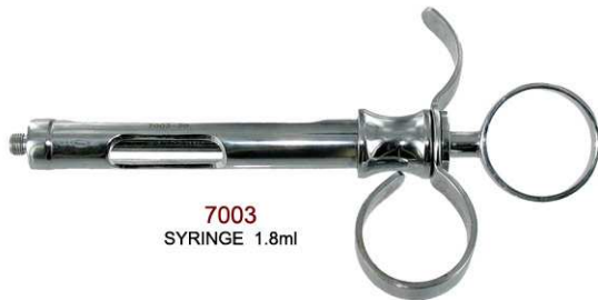
7003 SYRINGE 1.8ml