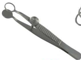
6442 10 X 10 mm