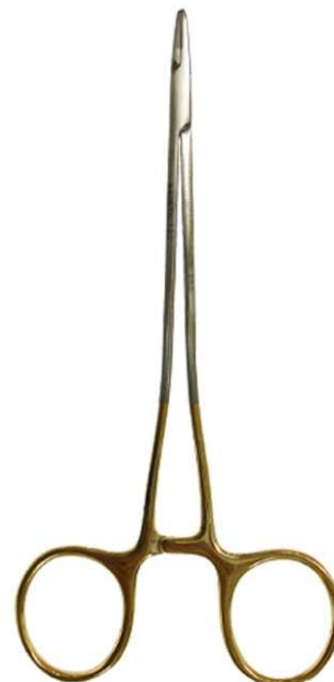
5505TN MICRO NEEDLE HOLDER T/C 15cm