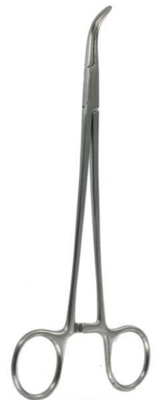
5316 BABY-MIXTER CRUVED 18cm