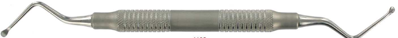
4102 85 LUCAS