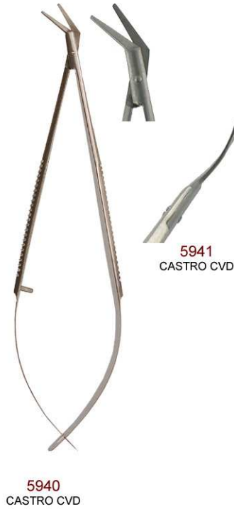
5941 CASTRO CVD