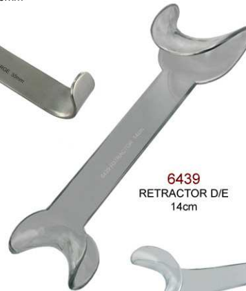
6439 RETRACTOR D/E 14cm