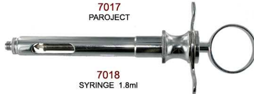
7018 SYRINGE 1.8ml