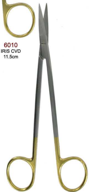
6010 IRIS CVD 11.5cm