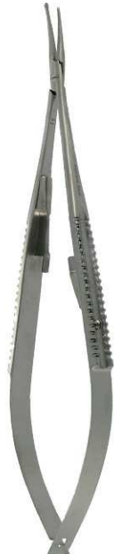
5526 CURVED WITH SPOON 15cm