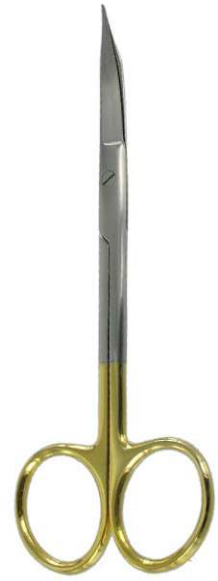
6006 GOLDMAN-FOX 13cm