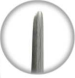
4501 PARTSCH 17cm