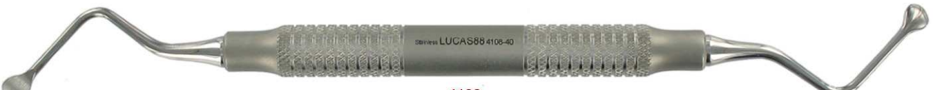
4108 88 LUCAS