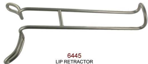
6445 LIP RETRACTOR