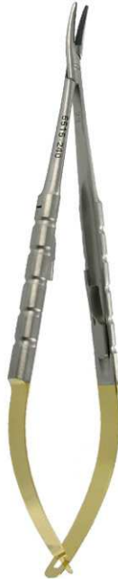
5515 CASTROVIEJO T/C CURVED 16cm 5 1/2"