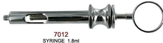
7012 SYRINGE 1.8ml