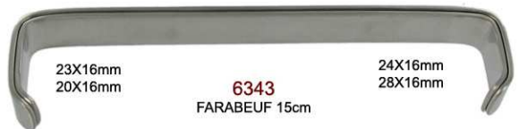
6343 FARABEU 15cm