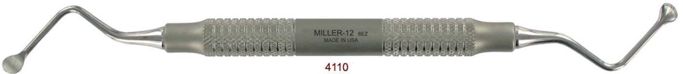
4110 12 MILLER