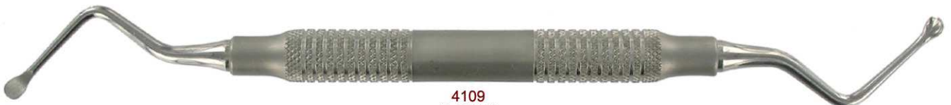
4109 11 MILLER