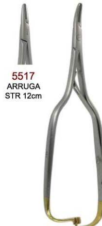
5517 ARRUGA STR 12cm