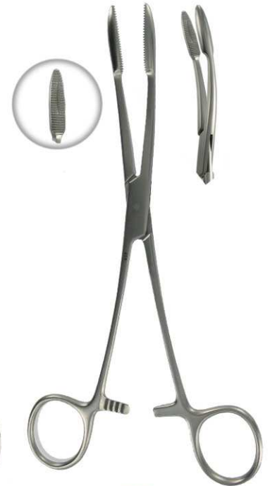
5208 WITHOUT RATCHET 20cm