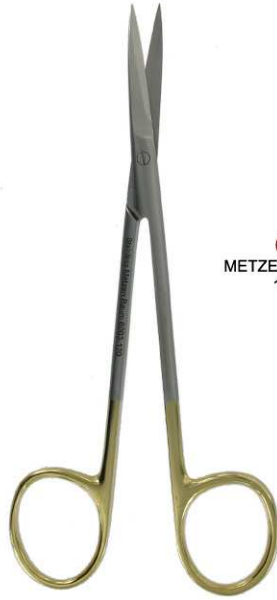
6003 METZENBAUM 14.5cm