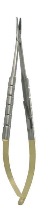
5513 CASTROVIEJO T/C 16cm 5 1/2"

For holding and guiding the needle securely during suturing.