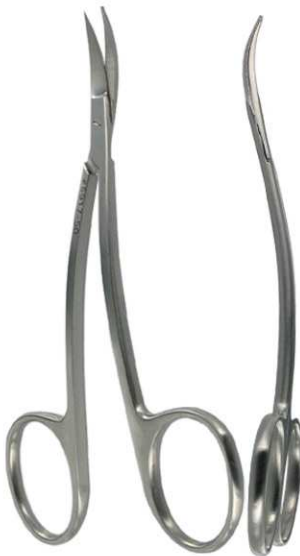
5917C LA GRANGE CVD 11.5cm