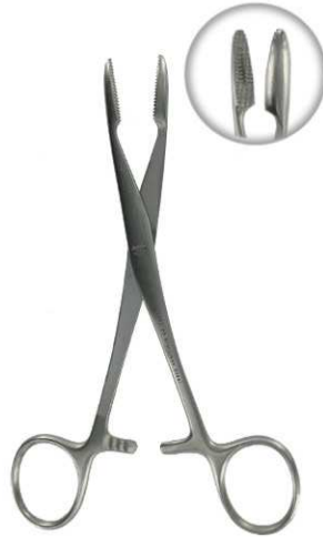
5202 WITHOUT RATCHET 14.5cm