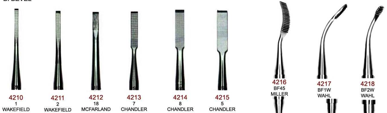
4210 1 WAKEFIELD 4211 2 WAKEFIELD 4212 18 MCFARLAND 4213 7 CHANDLER 4214 8 CHANDLER 4215 5 CHANDLER