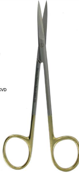
6005 METZENBAUM 18cm