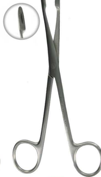
5207 WITHOUT RATCHET 20cm