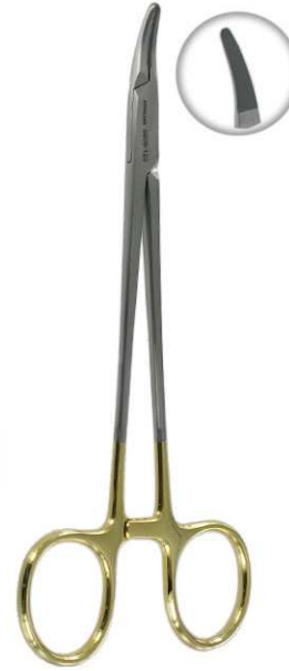
5506 CRILE-WOOD CURVED 15cm