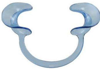
6437 SPANDEX LARGE 12.5cm