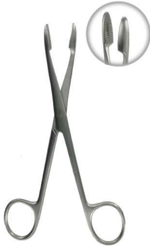
5201 WITHOUT RATCHET 14.5cm