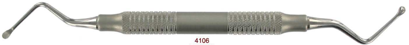
4106 10 MILLER