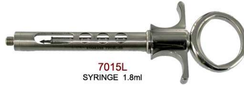
7015L SYRINGE 1.8ml