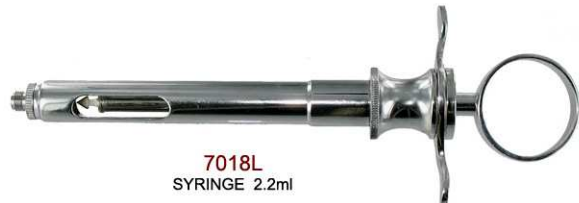
7018L SYRINGE 2.2ml