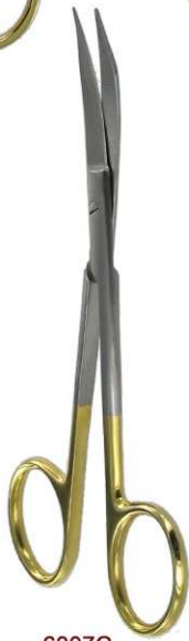
6007C GOLDMAN-FOX CVD 13cm