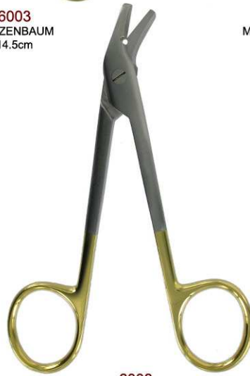
6008 WIRE CUTTING 12cm