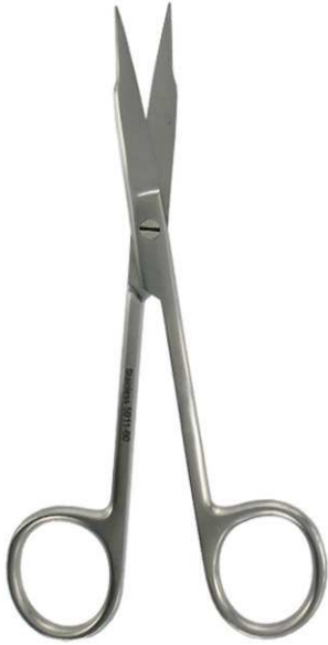
5911 GOLDMAN-FOX 12.5cm