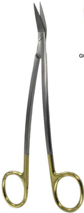
6011 DEAN 16.5cm