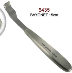
6435 BAYONET 15cm