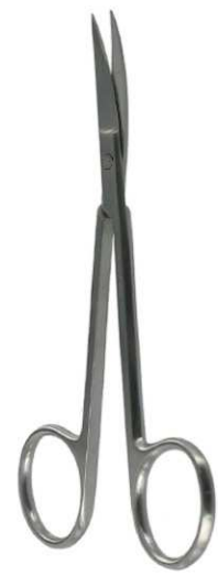
5920C IRIS CVD 11.5cm