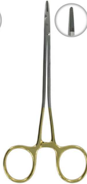
5505TN MICRO 15cm