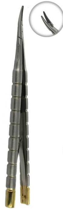
5409C CASTROVIEJO T/C 16CM CVD