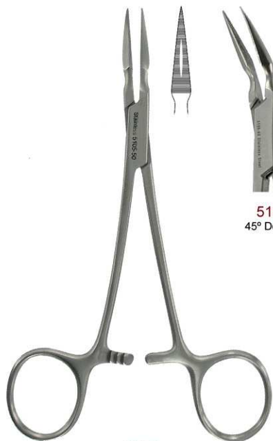
5105 ROOT FRAGMENTS STRAIGHT

For extracting root tips of the tooth where normal forceps cannot reach.